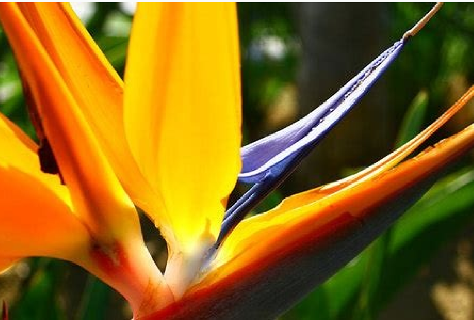
The war of art indigo.